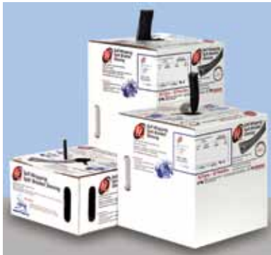
F6 is available in self storing boxes.

F6 will bend to a tight radius without distorting or splitting open and, unlike full rigid tubing, will not impair or affect the flexibility of harnesses. Allows for addition or removal of wires without disassembly.