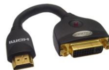
Optional 35-716 HDMI Male to DVI Female Adapter