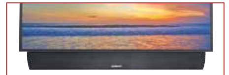
Compatible with all leading Outdoor TVs