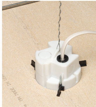
4 Install supplied NM cable connector (1/2" or 3/4"). Pull cable.