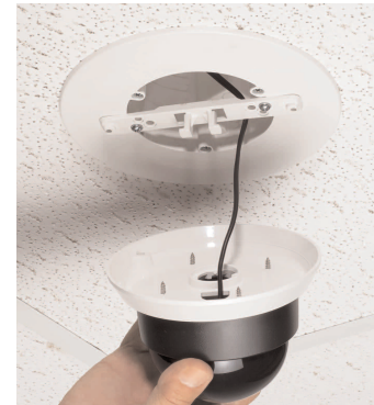
6 Mount camera to mounting plate. Place assembly on bracket. Turn clockwise to lock. Install set screw.

Note: Cameras with a base diameter from 4.5" to 7" mount directly to the box flange (do not require the mounting plate).