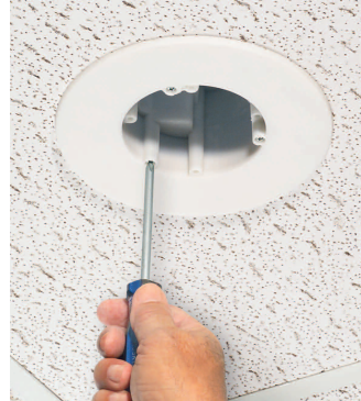
2 Align box as necessary. Tighten mounting wing screws.