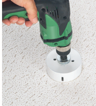
1 Cut hole in the ceiling (tile) with 4" hole saw.