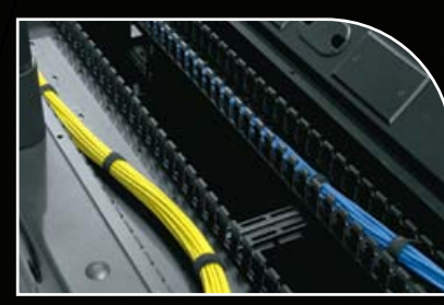
SERIOUS RELIABILITY designed for cooling, power, and cabling

SERIOUS STYLE choice of attractive standard designs, or custom