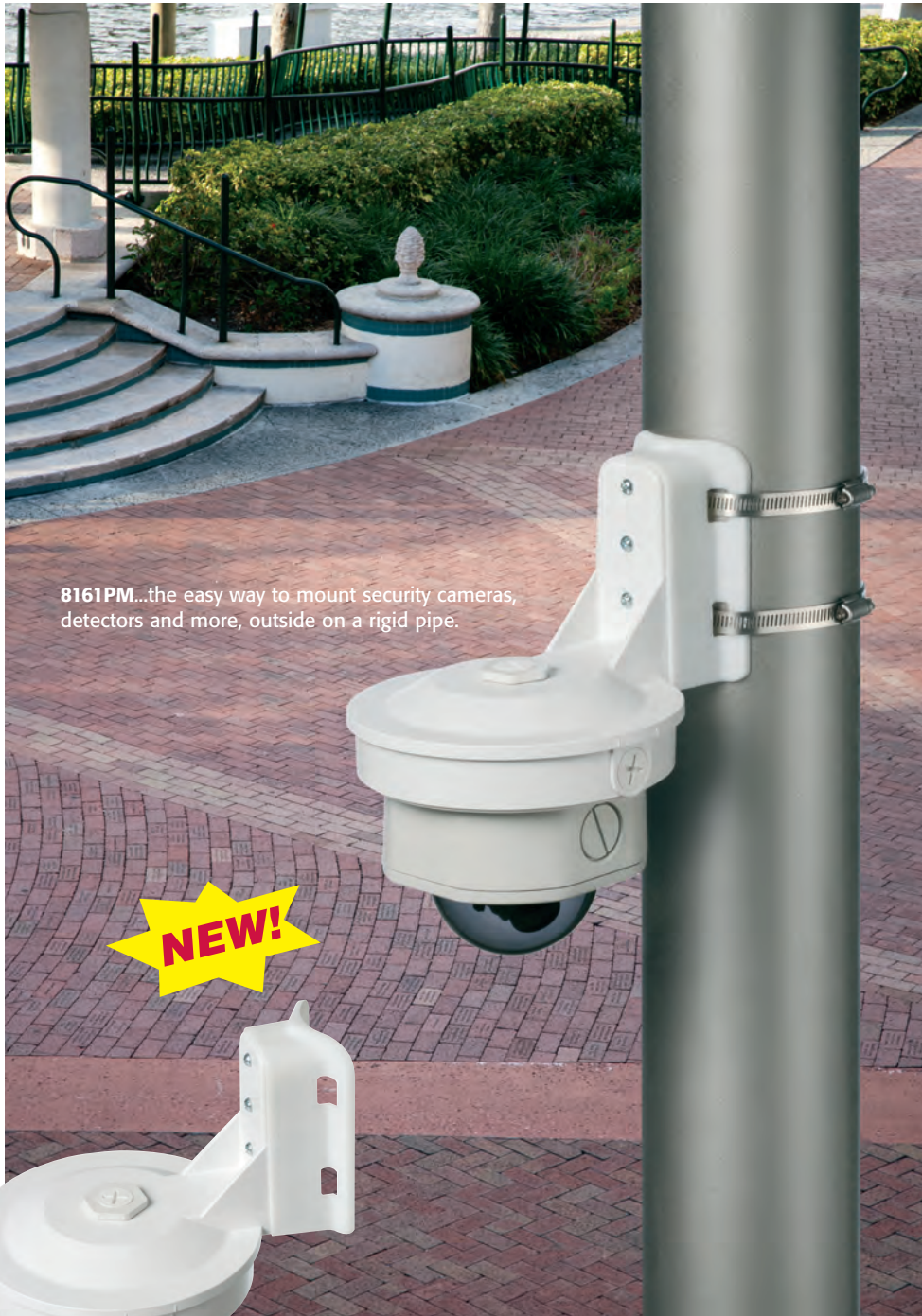
8161PM...the easy way to mount security cameras, detectors and more, outside on a rigid pipe.

For Outdoor Security Camera, Electrical Accessories Installations