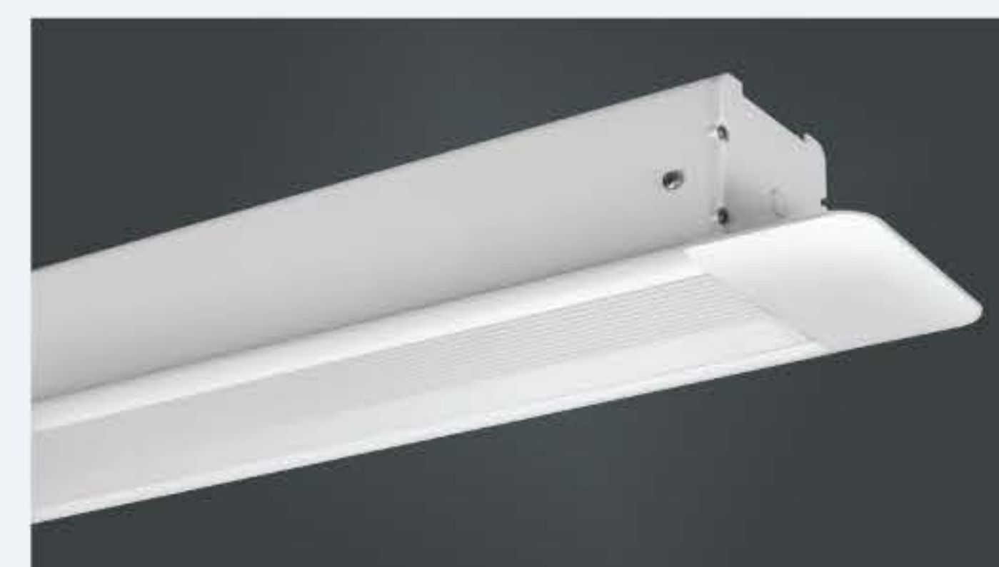
Spirit Series completely retracts into the case while not in use.