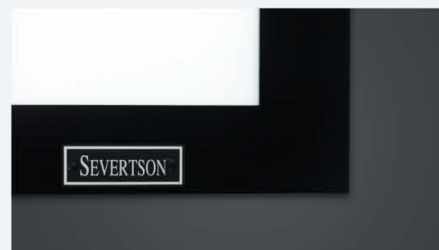
The velvet-wrapped frame provides a clean, crisp viewing edge.

Note: The most common sizes and aspects are listed here. Visit severtsonscreens.com/model/LF for more available sizes and specifications.