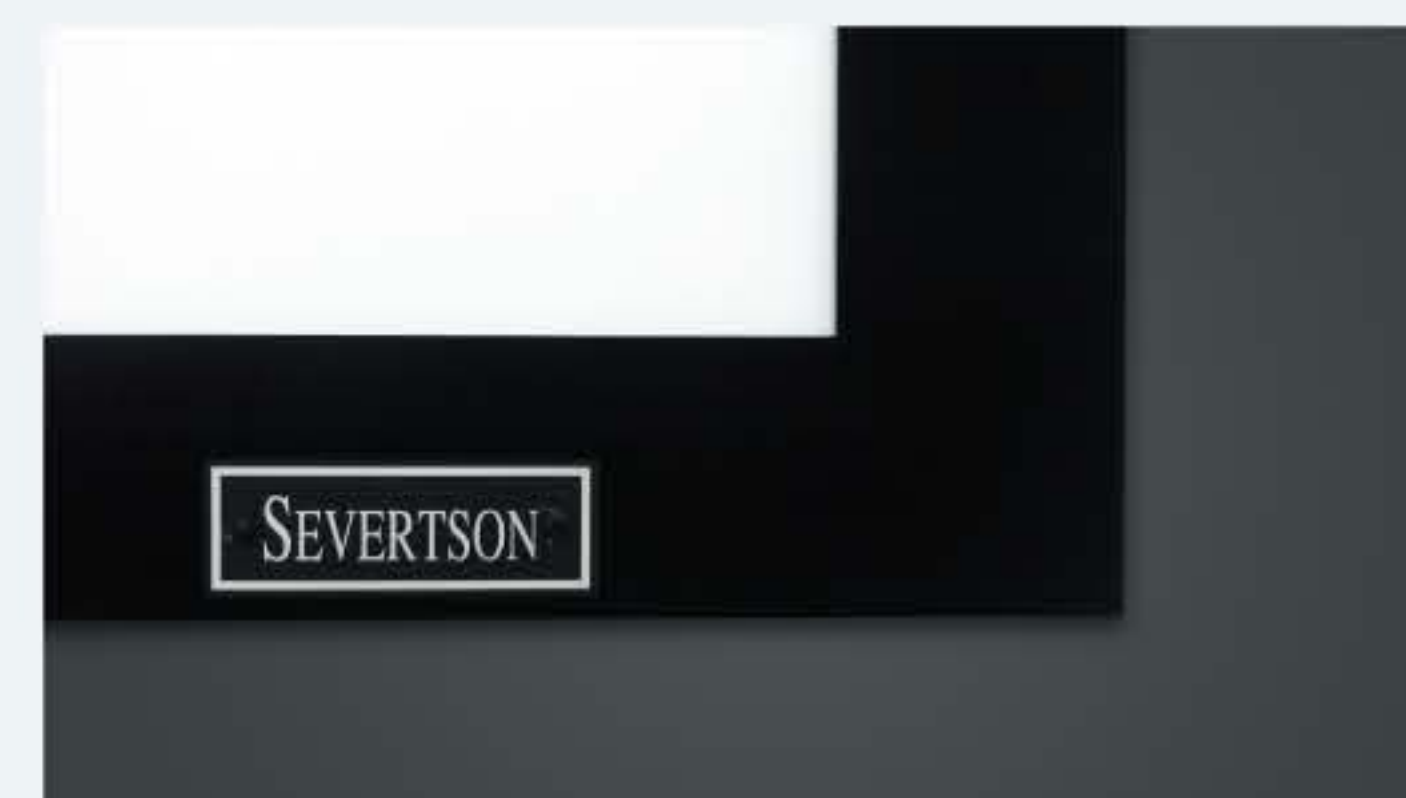
The velvet-wrapped frame provides a clean, crisp viewing edge.

Note: The most common sizes and aspects are listed here. Visit severtsonscreens.com/model/LF for more available sizes and specifications.