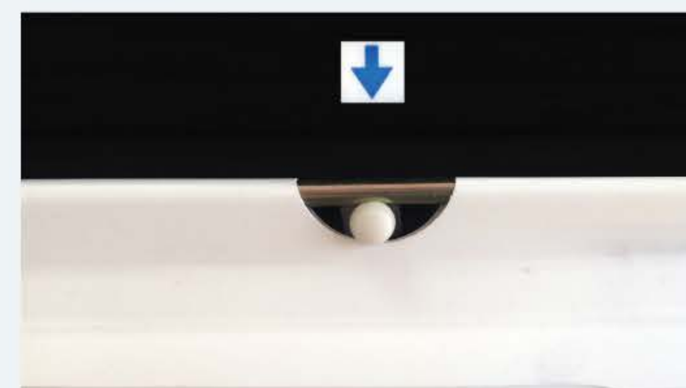
Screen material is held perfectly flat with Severtson Flex RTS