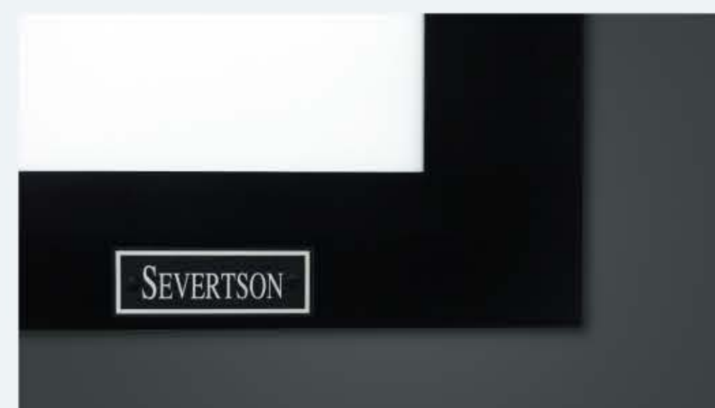
The beveled velvet-wrapped 4" frame provides a clean, crisp viewing edge.