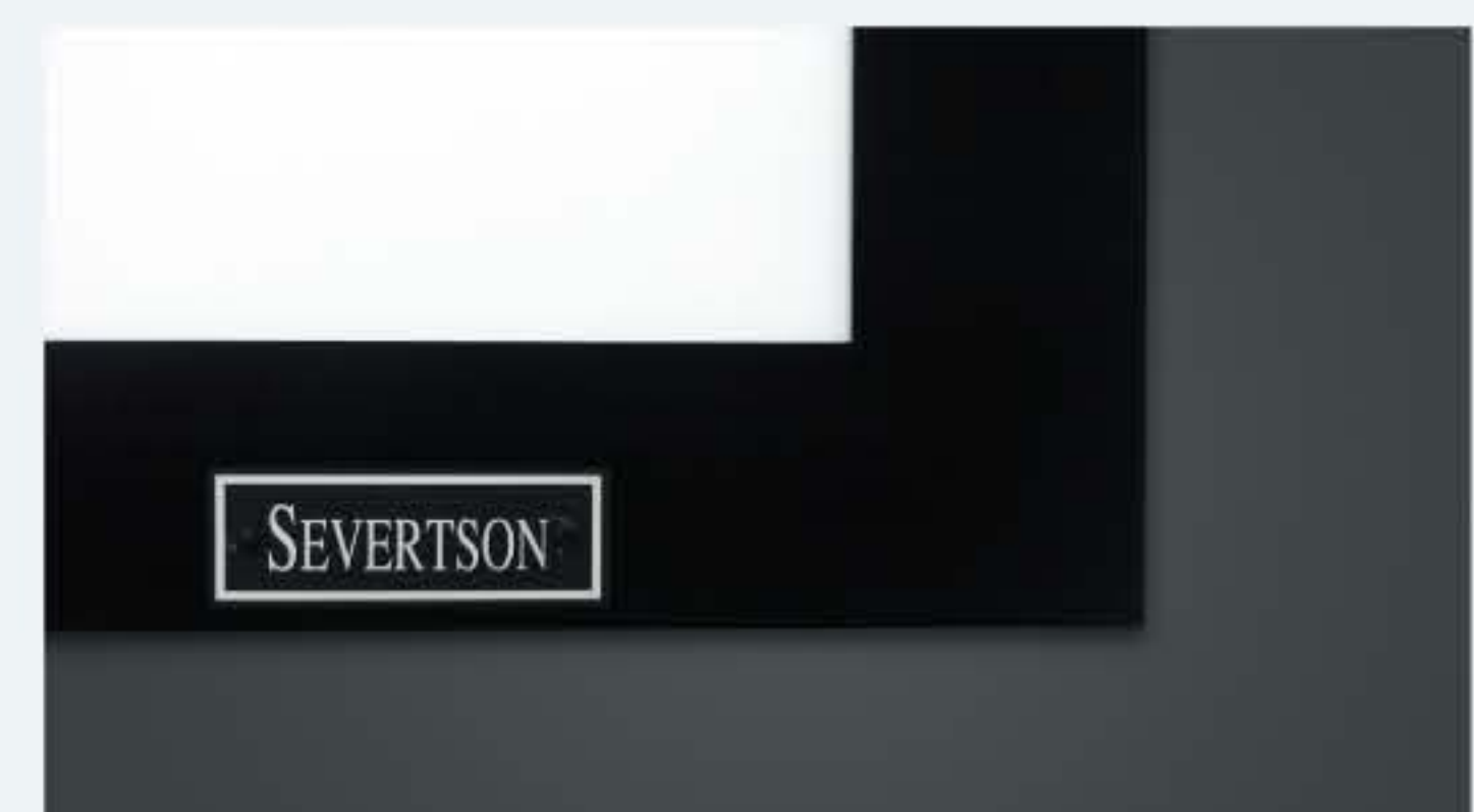
The velvet-wrapped frame provides a clean, crisp viewing edge.