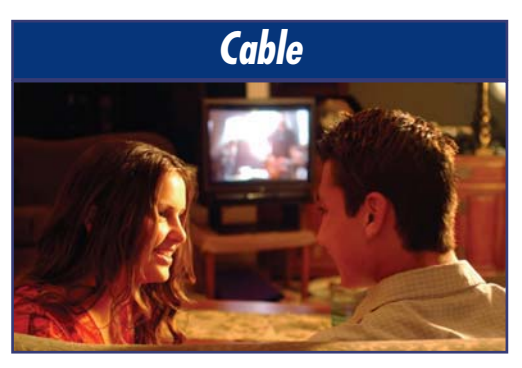
Computer/Office Equipment • Entertainment System • Security System • Appliances • Heating & Cooling • Lighting Control Sprinkler Systems • Electrical Wiring System • Telephone • Fax Machine • Cable Modem • Plasma TV/VCR