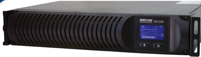
PRO1500RT - 1500VA/1050W Line Interactive UPS