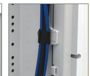
SMC fits mounting tape for cable management.