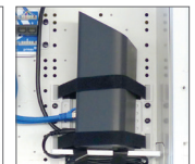
Shelf Mounting System (SMS)