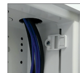
Installed SMC for affixing sidewall to stud.