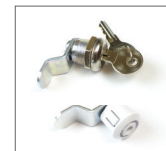
125-1073 Key Lock 125-1678 Hex Lock