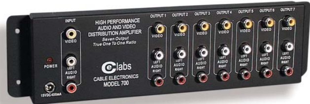
AV400 & AV700 Composite Video/Audio Distribution Amplifiers