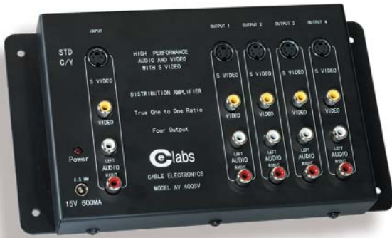
AV400SV Composite Video/Audio/S-Video Distribution Amplifier

High quality amplifier allows for multiple signal distribution equal to source signal output with no signal loss.