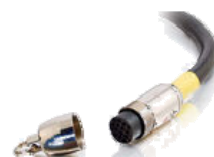
42134 and 50710