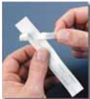
Easy-peel split-back label