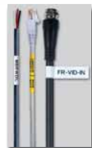
Horizontal Cable/Wire Wraps & Flags