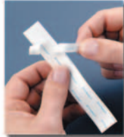
Easy-peel split-back label

Easy-to-peel labels available in split-back and dry-edge varieties.