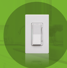
Leviton Connected Switches