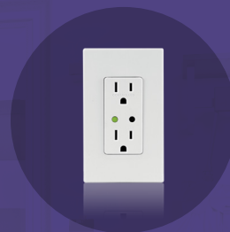
Leviton Load Control

Requires SmartThings Hub or compatible device with SmartThings Hub functionality. Products sold separately.