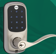
Connected Door Lock

Requires SmartThings Hub or compatible device with SmartThings Hub functionality. Products sold separately.