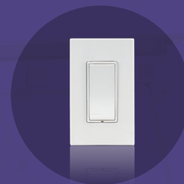
Leviton Connected Switches